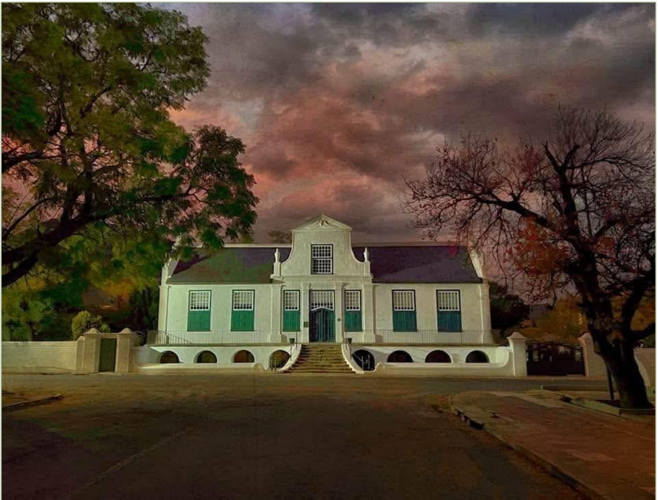
Reinet House at Night