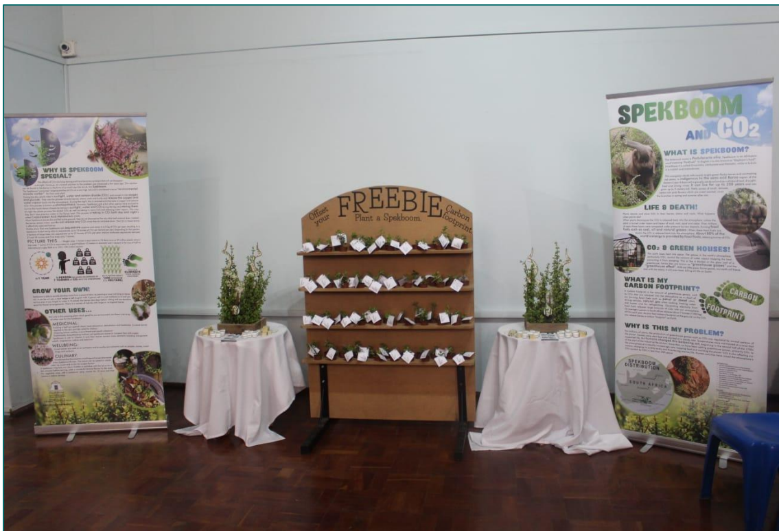
Die Spekboomstalletjie Tydens Internasionale Museumdag 2023

fisiese, emosionele en sosiale welstand. Die Spekboom-uitstalling, wat spesiaal vir hierdie geleentheid ontwerp is, het werklik die kollig op die Graaff-Reinet Museum geplaas tydens die Internasionale Museumdagvieringe in Makhanda. Die uitstalling het die belangstelling en verbeelding van beide leerders en amptenare aangegryp, en almal was dit eens dat ons die 2de prys verdien het. Ons is baie dankbaar teenoor Country Mouse Graphic Design , Union Hoërskool, wat hul Spekboomstaander aan ons geleen het, Rachel's Garden, wat handroom en Spekboom-seep voorsien het, en Boundless, wat die pragtige Spekboom Koedoe-koppe verskaf het waarmee ons die stalletjie versier het. Dit was voorwaar 'n spanpoging.