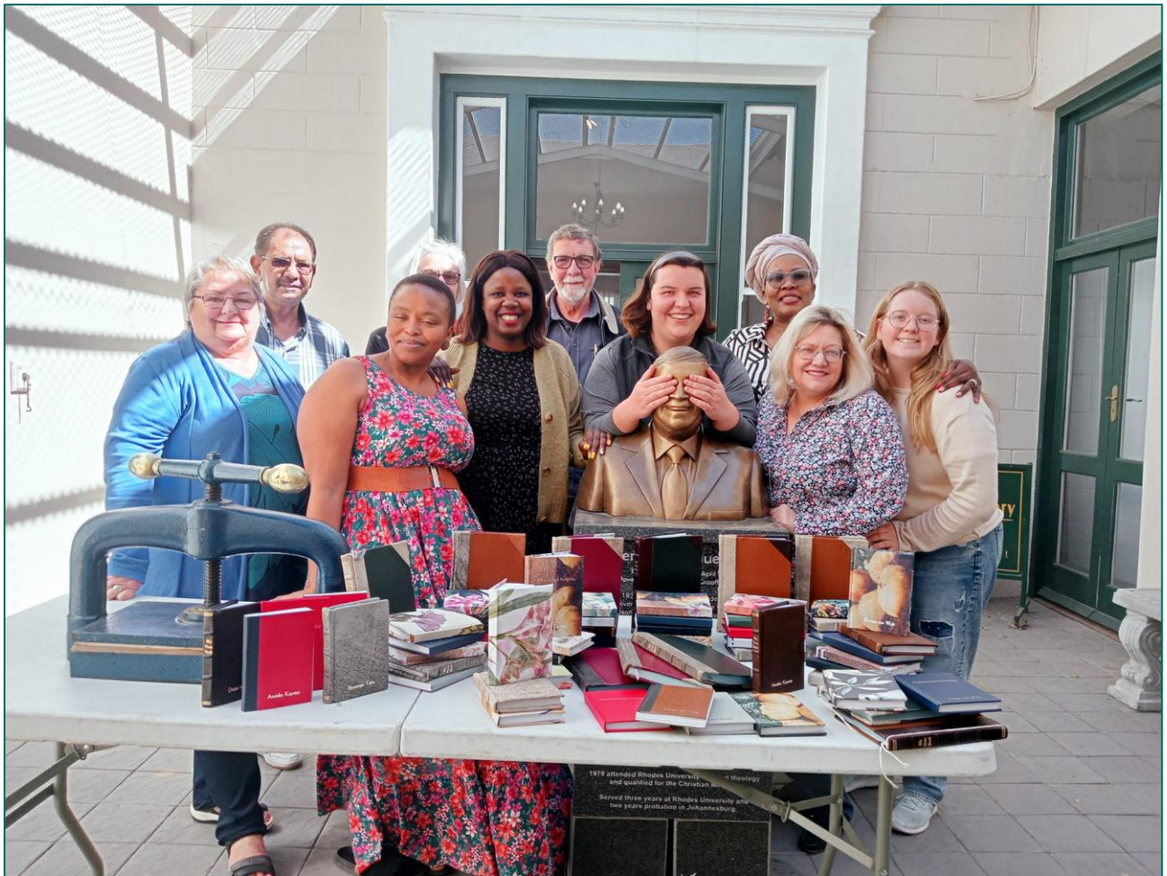
Colleagues and Members of the Public attending The Bookbinding Course

restourasie van historiese boeke. Daar was ook drie deelnemers uit Johannesburg, en slegs twee plaaslike inwoners.