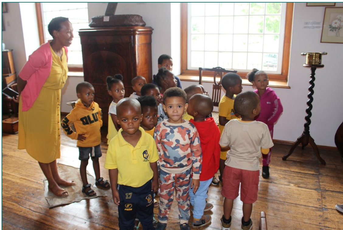
Die Leerdertjies van Khanyisa Dagsorg

Aangesien talle skole met die aanvang van die jaarlikse atletiek- en krieketseisoen, asook verskeie sporttoernooie besig is, verskuif die Museums se fokus aan die begin van elke jaar na kleuterskole en dagsorgsentrums in ons gemeenskap. Op 14 en 15 Maart het ons die voorreg gehad om Khanyisa Dagsorgsentrum by die museum te verwelkom. Leerders, tussen die ouderdom van een en vyf jaar het die besoek terdeë geniet, asook die museumpersoneel wat hulle op 'n begeleide toer geneem het. Die besoek is afgesluit met 'n inkleur-aktiwiteit waarin verskeie belangrike artefakte en voorstellings van museumgeboue uitgebeeld is, byvoorbeeld fossiele, die gewel van Reinethuis, die Riena Reinet-poppe en die historiese wingerd. As deel van die besoek is verversings aan al die kinders en onderwysers uitgedeel.