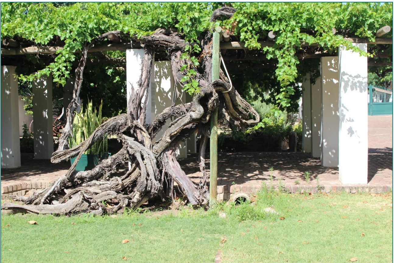
The Old Vine in the Garden of Reinet House

Ongelukkig is hierdie jaar deur verskeie uitdagings gekenmerk, insluitend herhaalde inbrake en kabeldiefstal, wat gelei het tot beskadigde slotte, deure en vensters. Die personeel het addisionele veiligheidsmaatreëls getref deur lemmetjiesdraad aan te bring, donker areas te belig en bykomende diefwering en veiligheidshekke te installeer.