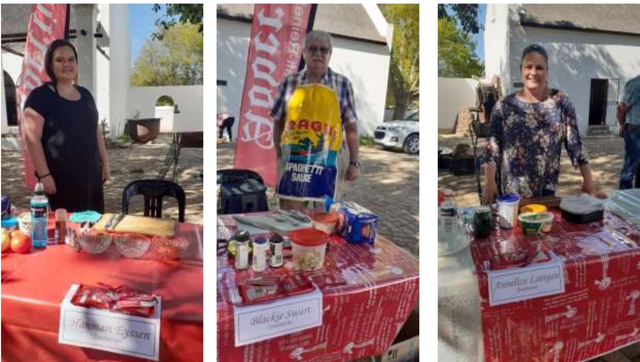
Participants in the Braaibroodjie Competition

In September 2022, the museum partnered with the Graaff-Reinet advertiser during heritage month to organise and present a South African Braaibroodjie competition. Three participants were selected from a number of entries. They were eventually invited to produce a delicious braaibroodjie for a panel of expert judges at Reinet house. The winner received a wonderful prize, and the event was a showcase of Graaff-Reinet's cultural tradition.