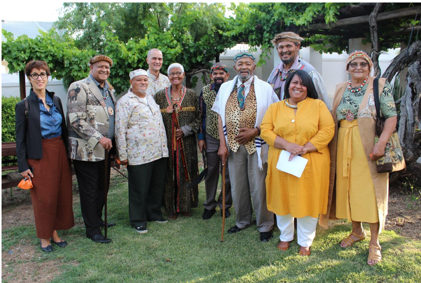
Tydens die opening van die dokumentêr: Origins: An Investigation into Khoi-San Heritage Sites