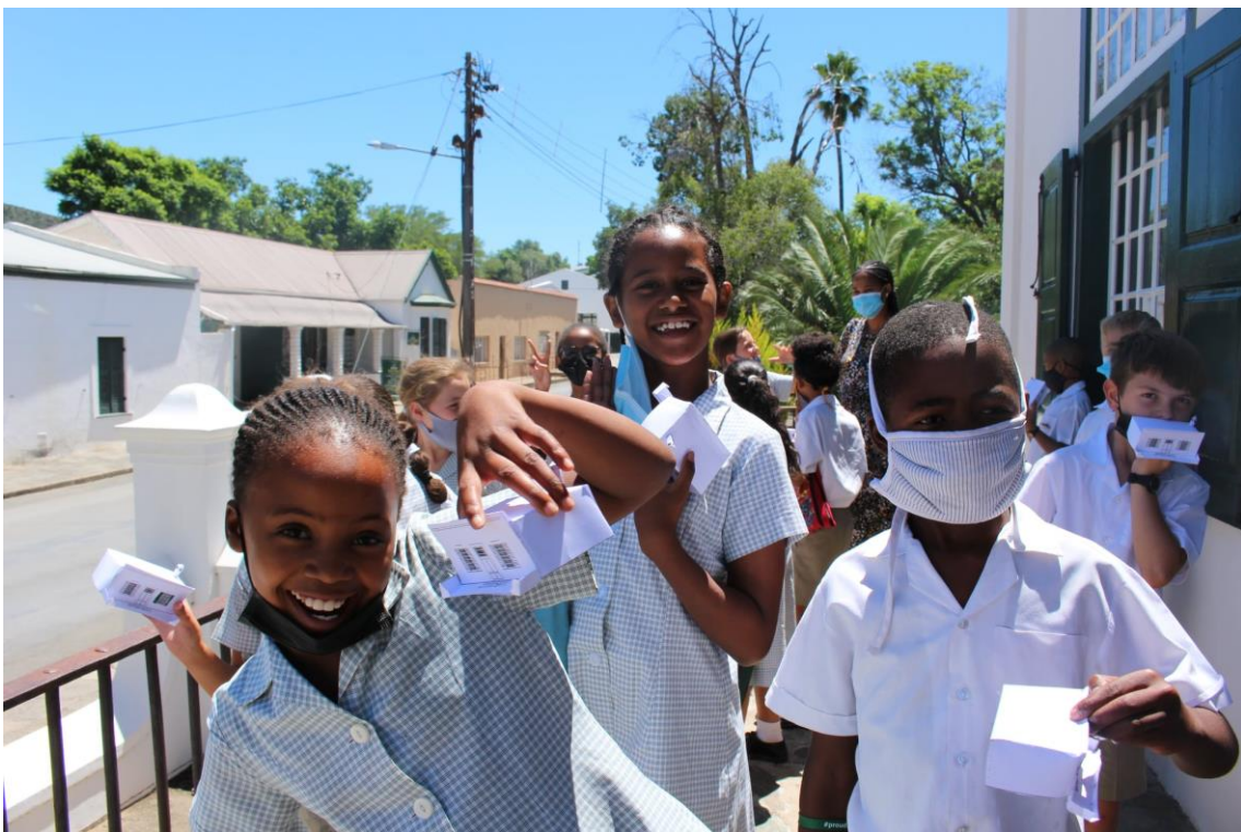
Union Voorbereidingskool besoek Reinethuis

Die begin van April 2021, ongeveer 'n jaar nadat die eerste Covid-19 geval in die land aangemeld is, het die museum die stadige maar sekere terugkeer van leerders beleef.