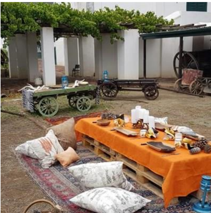
A scene from the Karoo Kombuis filmed at Reinet house