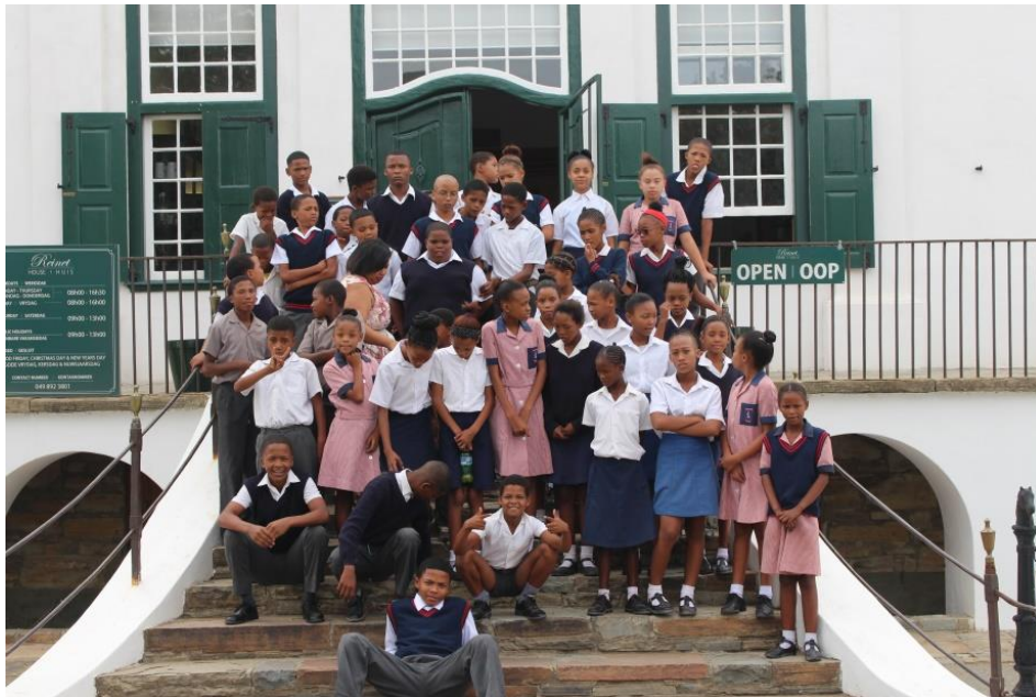
A group of Lingcom Primary learners

Our volunteers deserve special thanks. They are ever-willing to apply innovative instructional methods for the benefit of the learners and gladly assist wherever and whenever they are able to.