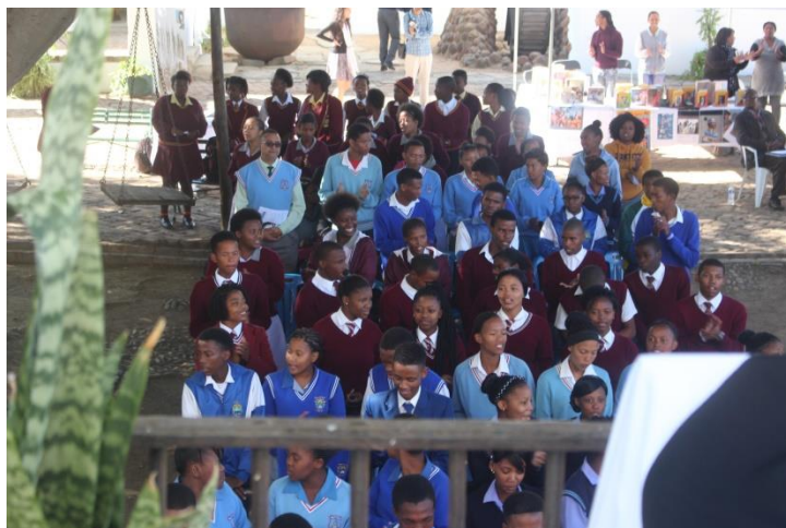
Sarah Baartman Internasionale Museumdagvieringe

Tóg het baie leerders hul weg na die museum gevind soos die Ekoklub van Union Hoërskool op 3 Maart 2017. Hier het een van ons Trusteeraadslede