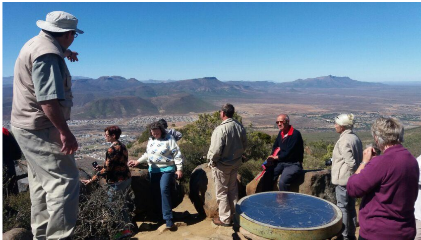
Glimpses of the 2017 SAVK Conference