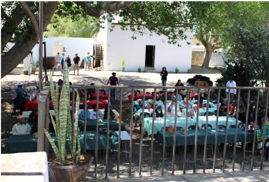
The Theo Thijssen Event

The Oral History Project remains firmly on the cards, as we struggle to find enough manpower to undertake further interviews to allow representative completion of the first phase of the project within budget. Members of the Board have offered their time and expertise voluntarily to see the project through to completion as inexpensively as possible.