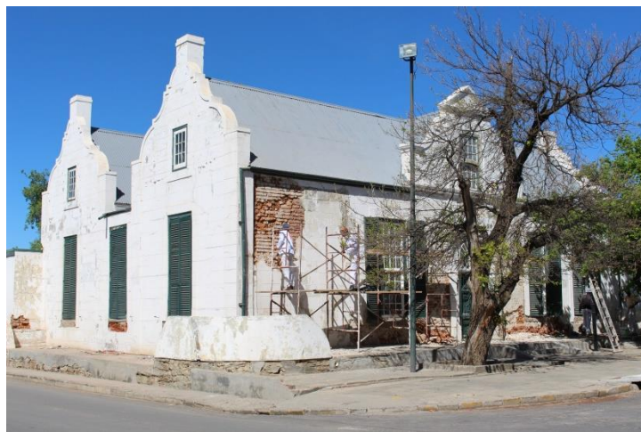
Restoration at The Old Residency commence

Great was our elation when The Rupert Historic Homes Foundation awarded R1.6 million towards the second phase of the restoration programme. Work commenced in October 2017. A massive clean-out of all the storerooms and the garage at the Old Residency was launched. We managed to sell most of the excess (non-acquisitioned) items, that had accumulated over many years, on a Facebook “garage sale”. By the end of March 2018 restoration work to the Old Residency was completed and the construction crew moved over to Urquhart House.